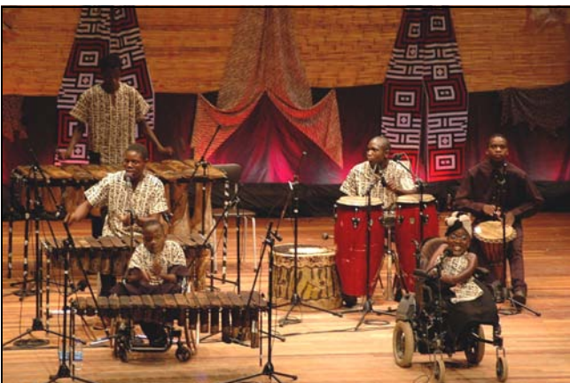
LIYANA band members perform their Afro-fusion sound of gospel, reggae and traditional Zimbabwean Shona music.

On January 27, 2009, elementary students of the Henry Viscardi School (HVS) enjoyed the music of LIYANA, an eight member band of self-taught musicians with severe physical disabilities from Zimbabwe. LIYANA is currently on tour in the United