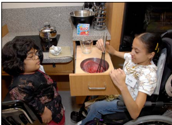
HVS students prepare "home-made" treats for all the guests who were present at the ribbon-cutting of the new Family and Consumer Science Lab at HVS.